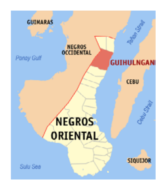
Figure 2 Map of Guihulngan City