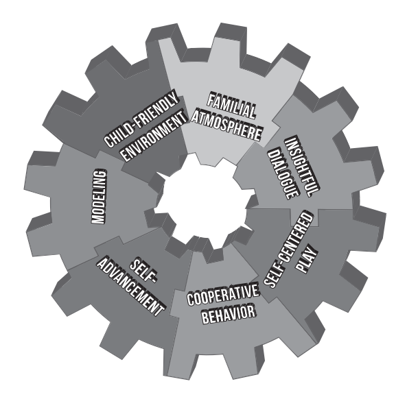
Figure 2. Developed Guidance Model on Personal and Social Competence